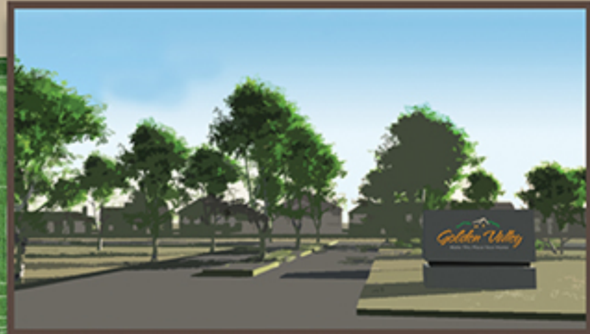
Conceptual rendering of Golden Valley entrance.

A Great Place To Call Home Welcome home to Golden Valley! With a beautiful park-like setting near several schools, this single-family neighborhood will be a safe, comfortable place to live and raise your family. Lots in a range of sizes are available for construction and you'll have the freedom of choosing your own builder to create a home that is uniquely yours. Golden Valley will be managed by a neighborhood association which oversees professional maintenance of the grounds and safeguards property values. All lots are outside the new floodplain.